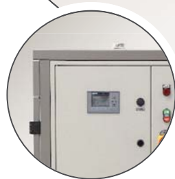
External text display with Ethernet port